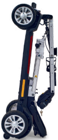
Convenient kickstand for small space storage!

Thank you, Golden Technologies, for giving me my life back!”